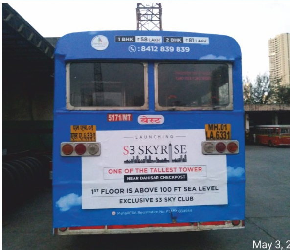
May 3, 2