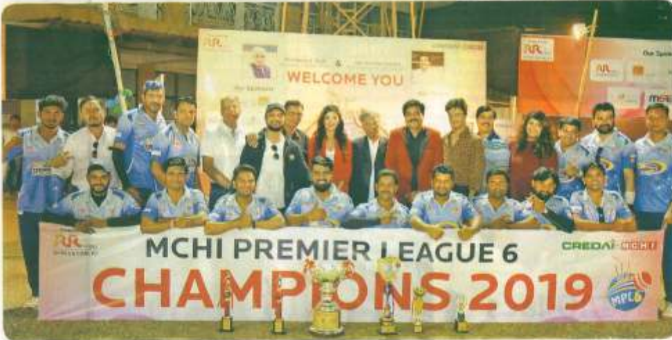
DIGNITARIES HANDING OVER CHAMPIONSHIP TROPHY TO THE SETHIA INFRASTRUCTURE TEAM