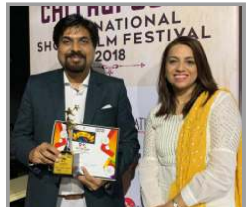
Music Video Award for Shree Ganesh