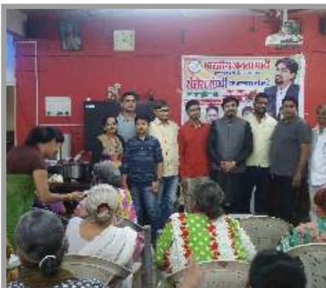
S3 Celebration at Old Age Home