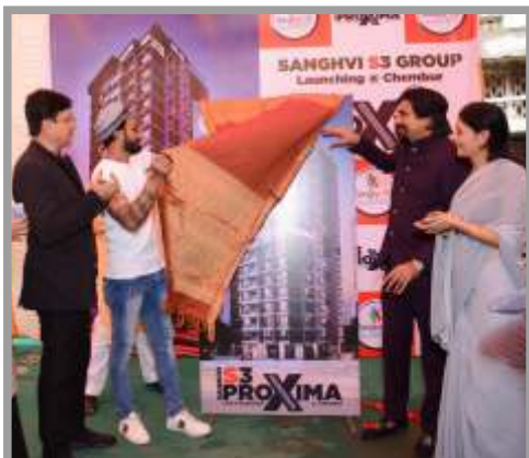
Launch of S3 Proxima