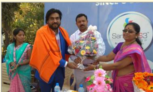
Developing Infrastructure at Asangaon

of Developing Mumbai & Beyond 1983 - 2018