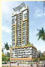
Shree Mohankheda Heights Ghodapdeo - Mazgaon