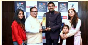
Mid-day Icons Award 2016