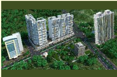
Sanghvi S3 EcoCity - Near Dahisar Check Post