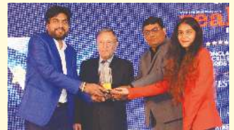
Realty Plus Award 2016