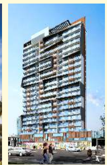
S3 Orion Lower Parel