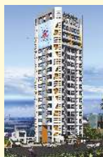
Sanghvi Heights Wadala