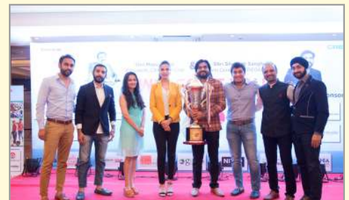
Spearheading Friendly Brotherhood through Organizing MPL 5