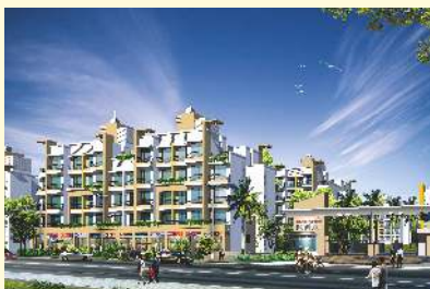
Sanghvi S3 Paradise - Asangaon (Shahapur)