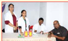
Free Medical Camp