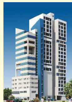
S3 Parshva Byculla