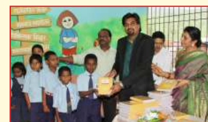
Note Book Distribution