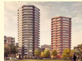
S3 SkyCiti Dombivli