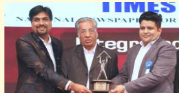
Accommodation Times Award 2016