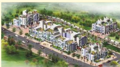
Sanghvi Nisarg - Lonavla