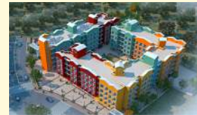
S3 World Asangaon (Shahapur)