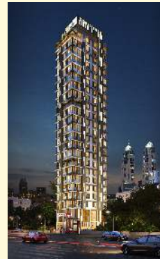
S3 Legend Tardeo