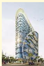
Sanghvi Jewel Malad