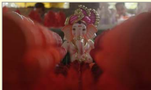
Producing Video - Shree Ganesha