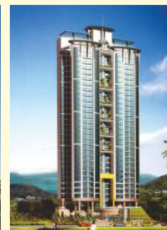
S3 Genex Lower Parel