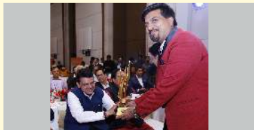
Lokmat Corporate Excellence Award 2017