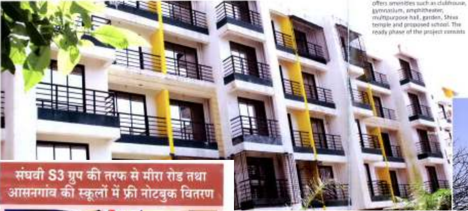
संघवी S3 ग्रुप की तरफ से मीरा रोड तथा आमनागांव की स्कूलों में फ्री नोटबुक वितरण

This mega township spread across nine acres of lush green spaces aims to enhance the lifestyle of the residents in Asangaon area.