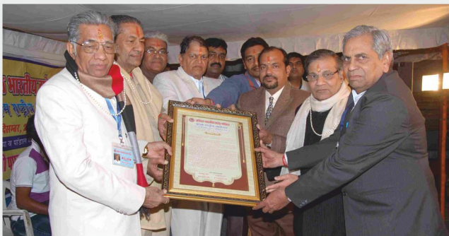
Honored at Tated sammelan