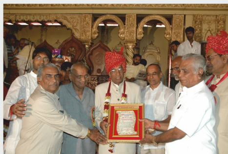
Honored for performing Maha arti on 100th death anniversary of Shri Rajendra Surishwarji Maharaj Saheb