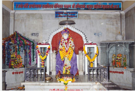
Saibaba Mini Shirdi Temple, Mira Road