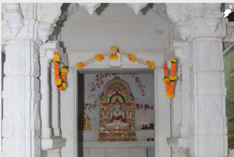
Shree Mohankheda Heights Jain temple at Mazgaon