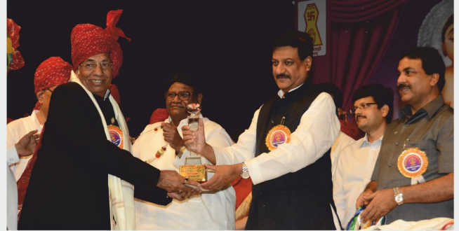
Honored at Jain samaj ratna award - 2013 by Ex CM Shri Prithviraj Chauhan