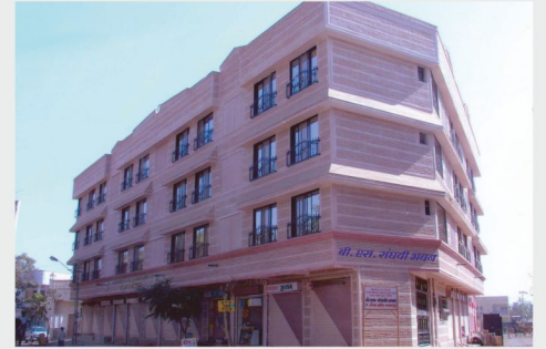
B.S.Sanghvi Bhavan (Dharamshala) at Palitana, Gujarat