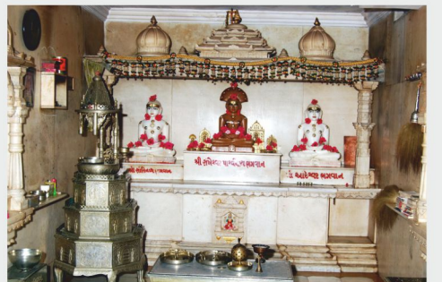
Jain temple Andheri (East)