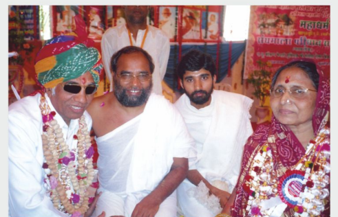
Samaj ratna and Shrivika ratna honor for magnimous efforts to uplift the community