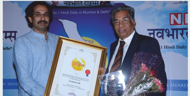
With Uddhav Thackeray at Navbharat times udaan award - 2011