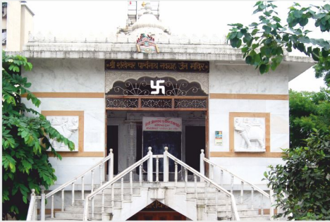
Shankheshwar Nagar, Jain Mandir, Dombivili