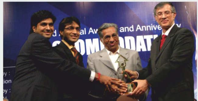
Best project of Thane award - 2007